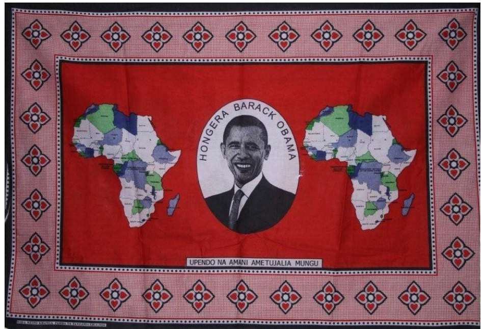
Hongera Barack Obama khangas cloth from Tanzania is on display at the Smithsonian National Museum of African Art. Swahili translates “Congratulations Barack Obama.” Phrase below is “Upendo na Amani Ametujalia Mungu” (“God has Blessed us with Peace and Love”).

WE have new brochures for your friends. Contact us for more copies: info@FOTanzania.org