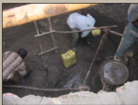
Digging the tank