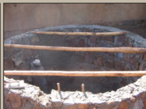
Poles and roofing