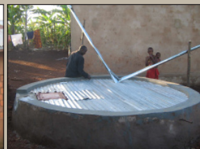
Finishing the tank

F riends of Tanzania has teamed with the Mavuno Project to supply five villages in the far western Kagera Region of Tanzania with nearby sources of clean, fresh water. Before the completion of the Mavuno Rainwater Harvesting Project, women and children in the area had to fetch water daily from distances as great as 5 kilometers from their village homes. Last