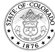
John Hickenlooper Governor