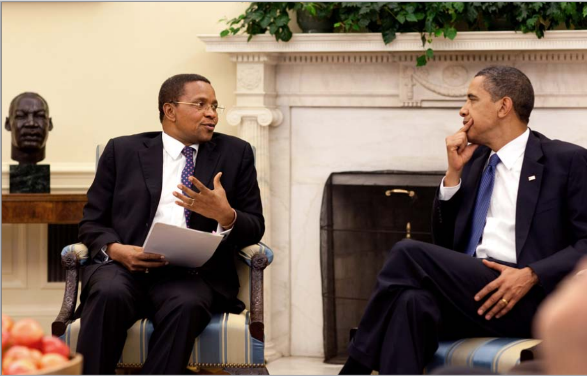
President Barack Obama meets with Tanzania President Jakaya Kikwete in the Oval Office May 21, 2009. This was the President's first meeting with any African Head of State. A bust of Martin Luther King is at far left.