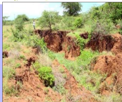
Before NJOWECA reforestation