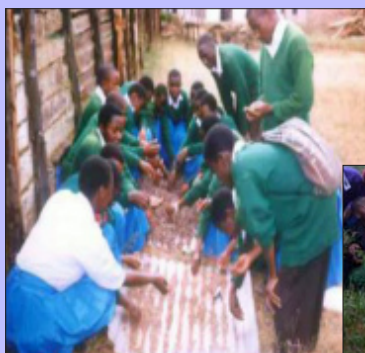
School children learning how to plant and care for seedlings